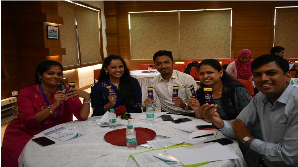
Small prizes for the fast doer: reinforcing the attainment of the objective of the workshop