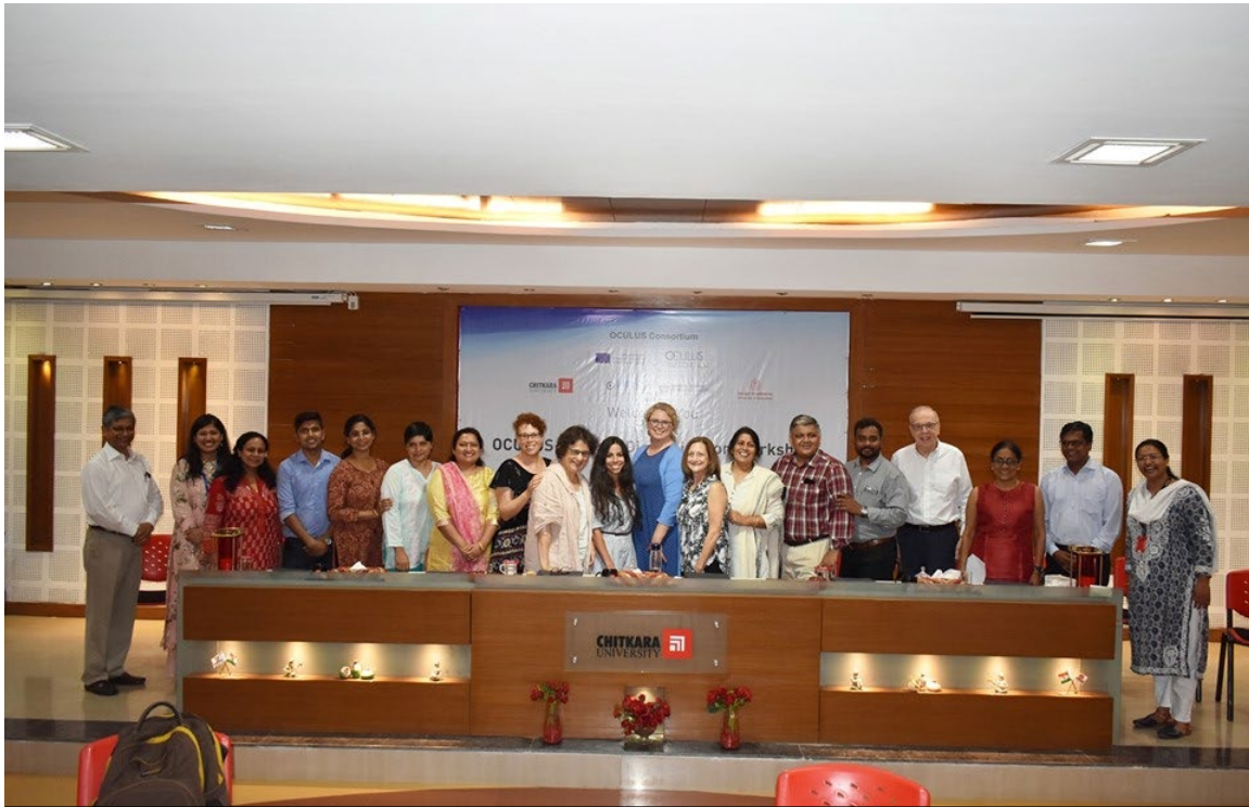
The OCULUS Dissemination team gathering on the OCULUS National Dissemination Workshop at Chitkara University Punjab